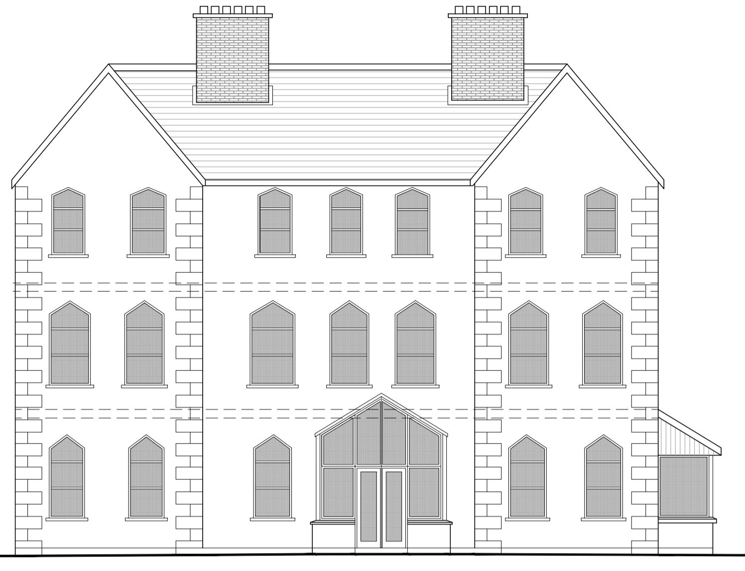
PROPOSED FRONT ELEVATION 1:200 @ A3 / 1:100 @ A1