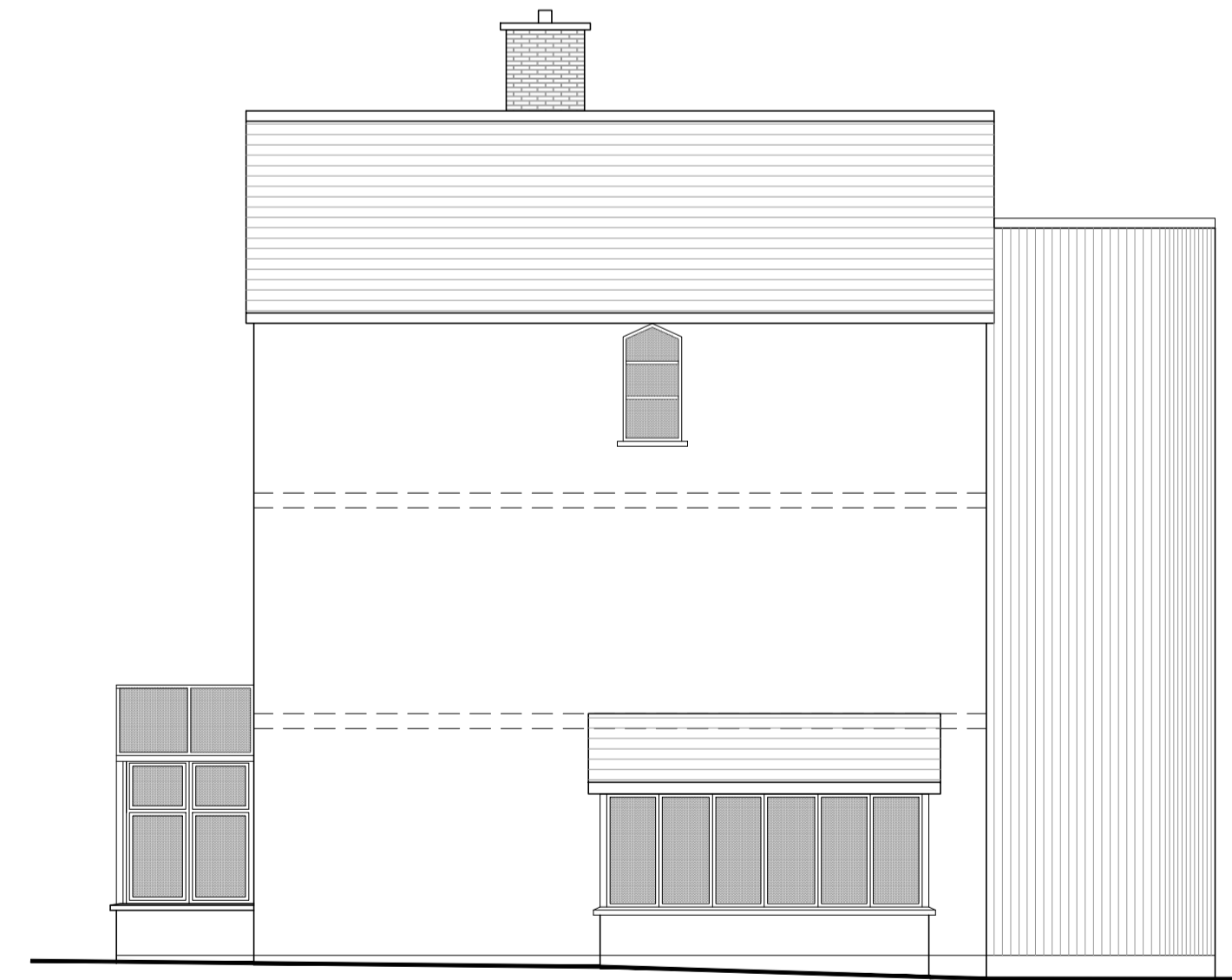
PROPOSED SIDE ELEVATION 1:200 @ A3 / 1:100 @ A1